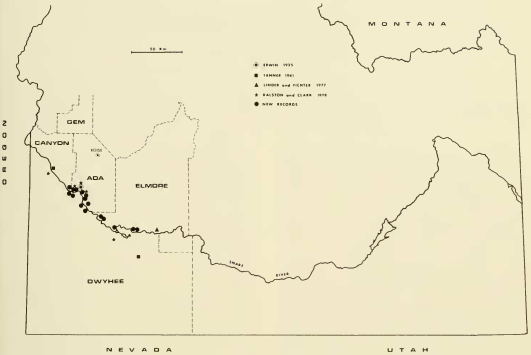
Fig. 3. Distribution of Sonora semiannulata isozona in Idaho. Some new localities are not shown because of close proximity to other localities.